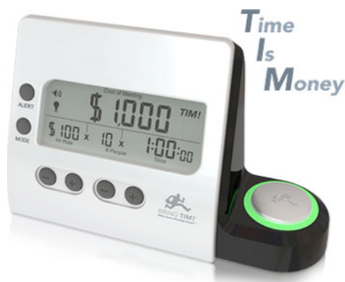
Figure 1: Bring TIM!

Bring TIM! is a new time management desk clock that proves to be both fun and functional. It calculates the real-time cost of business meetings. It is shown in Figure 1.