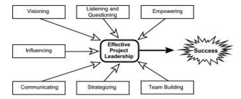
Figure 1: Major Project Leadership Skills

An understanding of the importance of "people" to the success of a project has developed rapidly over the last twenty five years.